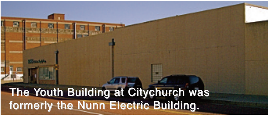
The Youth Building at Citychurch was formerly the Nunn Electric Building.

You see, there are times we run ahead of the Lord and expect Him to bail us out when we fail. In my life and ministry I have learned that if we wait on and watch the Lord we will receive His answer.