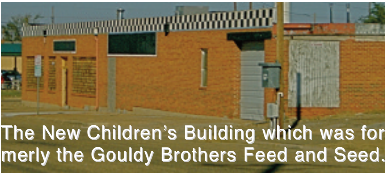
The New Children's Building which was formerly the Gouldy Brothers Feed and Seed.

I have prayed for the last several weeks for an answer of how to raise the money to purchase the Nunn Electric building and the Lord has given to me, what I believe, is His answer of how to proceed from here.